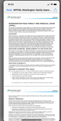
View and Share HR Toolkit Resources